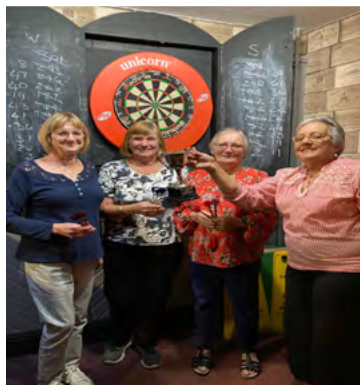
The 2024 Darts competition was won by Stockton Team 2.

Leisure Activities would like to wish you all a very Merry Christmas and a Happy New Year and hope to see you in 2025 at some of our events.