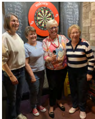
Runners up were Wishaw.