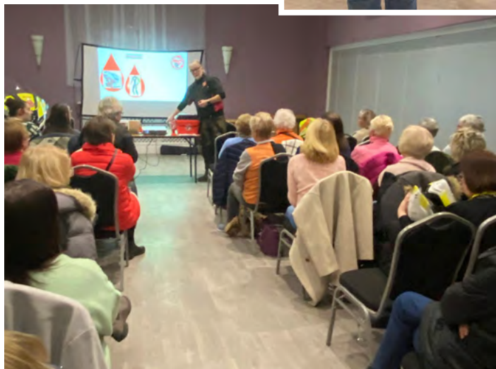
Members and guests enjoying the 'Blood Bikes' presentation